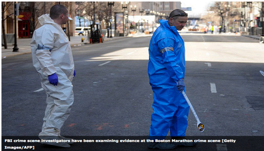
FBI crime scene investigators have been examining evidence at the Boston Marathon crime scene

Like 0 Tweet 0 LISTEN Email Print Share Comment