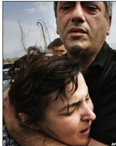
Thousands of people have fled Gori in fear of Russian air attacks

US Secretary of State Condoleezza Rice said it was vital that all sides cease firing, adding that Russian military operations "really do now need