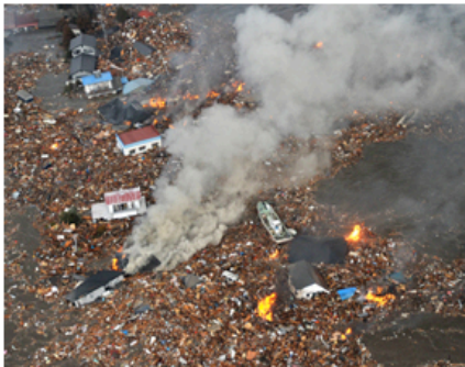
Houses are swept up by a tsunami near Sendai Airport after an earthquake on March 11, 2011. Click photo for more.

TOKYO (AP) -- A powerful tsunami spawned by the largest earthquake in Japan's history slammed the eastern coast Friday, sweeping away boats, cars, homes and people as widespread fires burned out of control. A local news report said at least 15 people were killed.